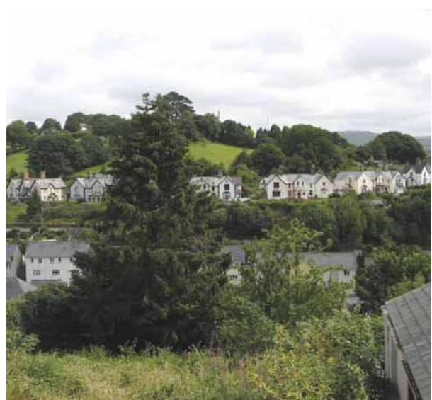
Trelawny Road Cottages and a view from Glanville Road