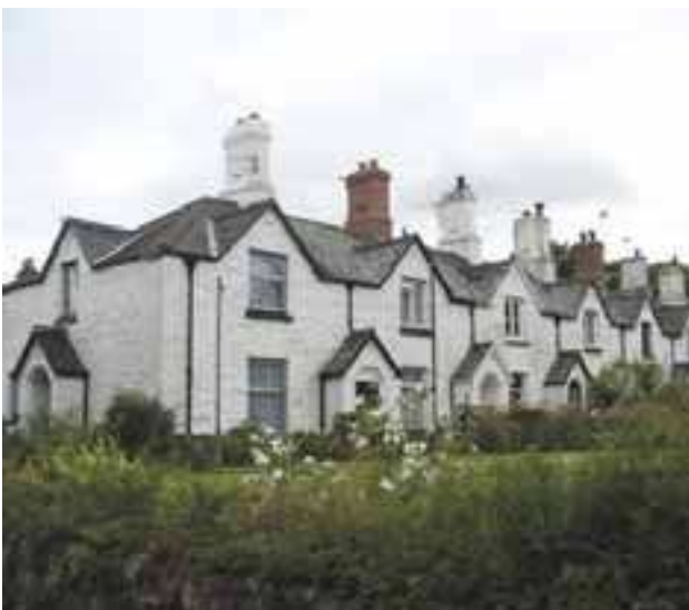
Westbridge Bedford Cottages

the running of the mine, it was Taylor who was to be the principal force behind the creation of the four and a half mile long Tavistock Canal, built to provide a more economical form of transportation for the ore from Tavistock to the quay on the Tamar at Morwellham. The canal was fed by a leat off the River Tavy and from 1817, metal ores were put on boats in the newly created wharf in what is now Canal Road, and taken to Morwellham Quay. This provided an important service to the mines around Tavistock such as Wheal Crowndale and Wheal Crebor, which were located just to the south of the town. During this time, it is unsurprising that Tavistock was to experience its first great period of rapid expansion: between 1801 and 1821 the population rose from 3,420 to 5,483.