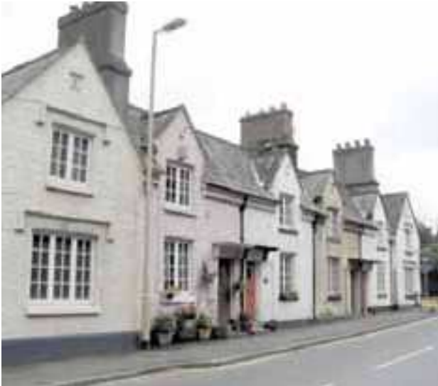
Bedford Cottages in Dolvin Road

Tavistock prospered as a result of the copper boom of the mid-19th century. The practise of copper mining had been in operation in Cornwall and West Devon since the Bronze Age, but from the 1770s, until the end of the 18th century, the copper trade had been dominated by the mines of Anglesey in northern Wales. The 1790s saw the closure of a number of mines across Dartmoor, but of great significance to the future of Tavistock was the 1796 discovery of copper in the vicinity of the neighbouring hamlet of Mary Tavy.